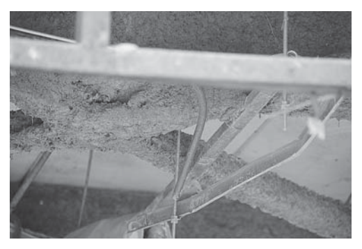
Figure 2. Crocidolite in the destroyed building

The Ritsumeikan Asbestos Research Project found two buildings which are used sprayed Asbestos, one was Crocidolite and another was Amosite. These buildings were not covered.