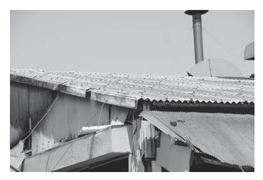
Figure 4. Roof boards including Asbestos

After the Tsunami, a lot of factories were destroyed. These factories used the boards including Asbestos. The rubble of the boards including Asbestos is stocked in the stockyards. In the stockyards, the rubble of the boards including Asbestos is crashed to small pieces. There is the risk of Asbestos fly.