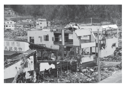
Figure 1. The building destroyed by Tsunami