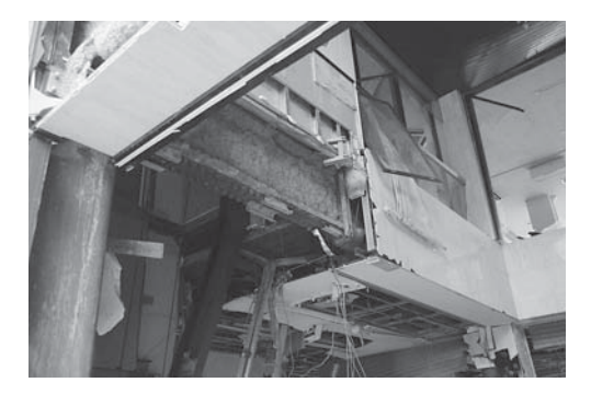
Figure 3. Amosite in the destroyed building