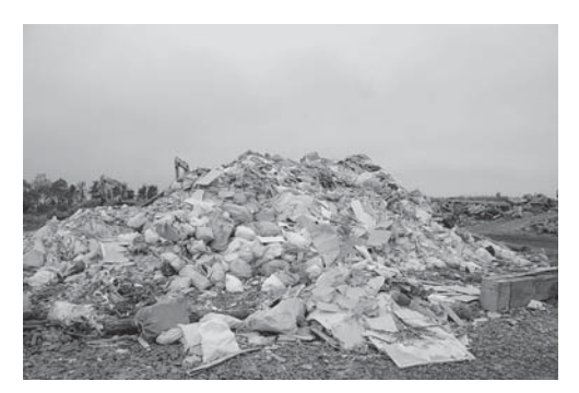
Figure 5. The boards including Asbestos in the stockyards of rubble