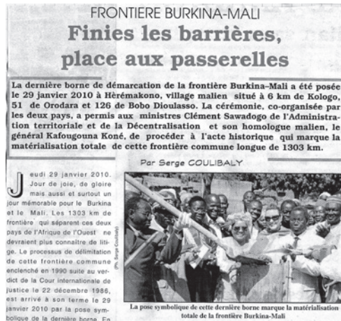
Figure 3: Resolution of the border dispute between Burkina Faso and Mali