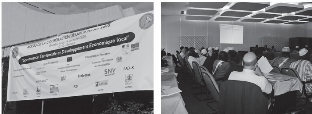
Figure 7: International meeting for local government cooperation in Mali