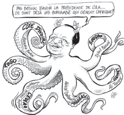
Figure 2: Satirical cartoon criticizing the political intervention by President Compaoré