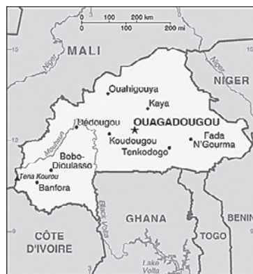
Figure 1: Borders of Burkina Faso

In addition to border and security issues, this paper focuses on decentralization. Decentralization has been one of the most formidable challenges in terms of governance in African countries since the democratization process started in the 1990s. Therefore, there is a need to examine the international cooperation and politics of local governments in the borderlands since these state began tackling democratization, in order to understand regional security and border issues. We cannot expect to find an efficient solution to problems and conflicts related to borders without considering the role of local actors inhabiting the borderlands, because the life and interests of the local people are closely intertwined with questions regarding borders and security. However, the existing frameworks for border and security management might be insufficient for addressing this question. It is meaningful to focus on the local actors because the borders have changed in character become vaguer in terms of their orientation.