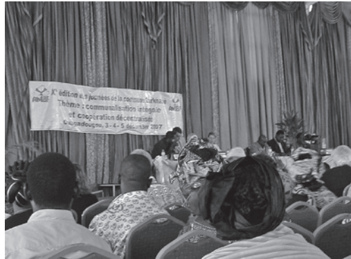
Figure 5: Session on local government triangular cooperation