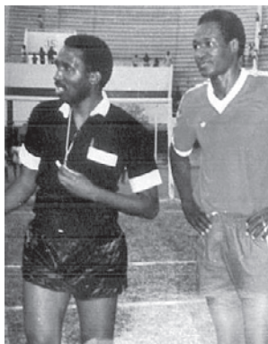
Figure 4: Leaders of Burkina Faso

During the first war between Burkina Faso and Mali in 1974, the name of a young soldier, future President Thomas Sankara, was diffused among the people of Upper Volta because he had bravely fought in Malian territory. This war brought Sankara much admiration from the Voltaic (Burkinabe) people. During this war,