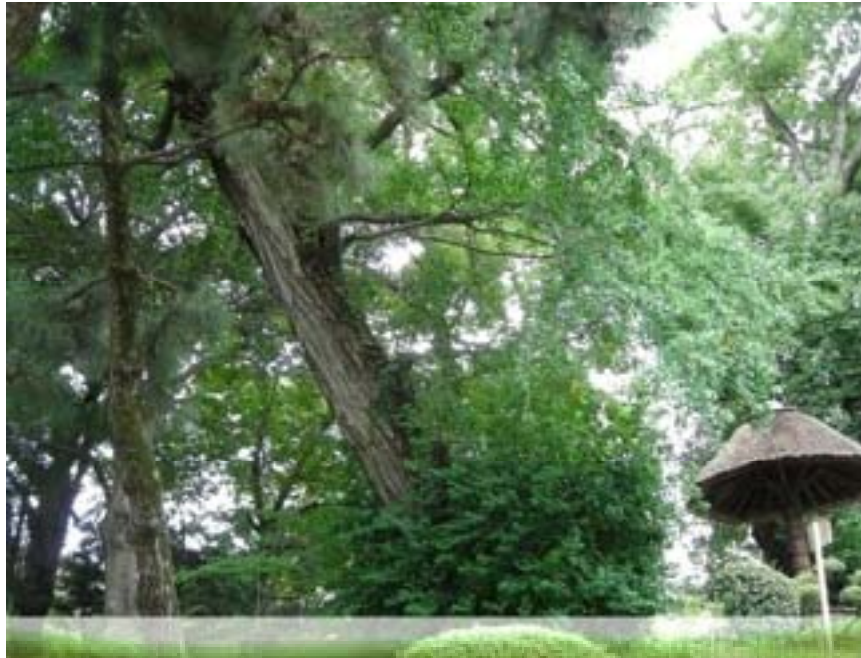
Ginkgo tree ( Ginkgo biloba )