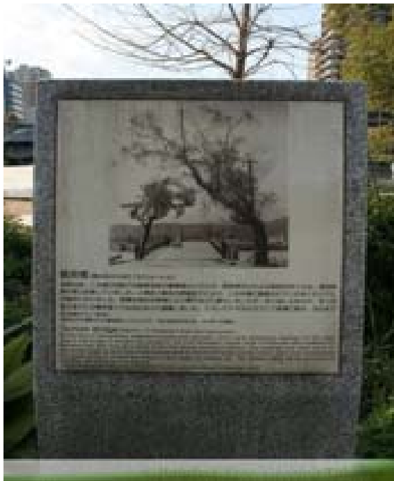
Weeping willow ( Salix babylonica ) near Hijiya park

Few trees survived the atomic bombing - yet the new sprouts of the ones that did become the embodiment of hope for survivors. About 170 trees in some 55 locations within the roughly 2 km radius of epicenter, officially registered by Hiroshima City as A-bombed trees or “Hibakujumoku