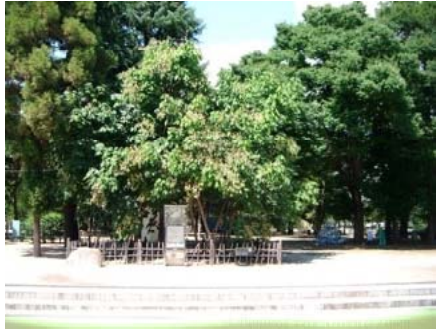
Chinese parasol trees ( Firmiana simplex )