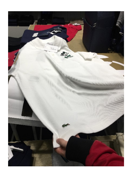
Picture 2 . A Polo T-shirt from a limited edition, which has its logo on the waist.