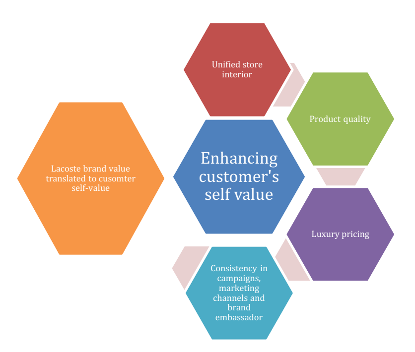
Figure 2. Brand marketing to outsiders

Having a Novak Djokovic collection at disposal means the consumer enjoys the same value expressed by the tennis champion (not to forget that Rene Lacoste was a tennis champion). Strictly speaking, the consistent brand value is the ultimate goal of Lacoste in its brand marketing activities, which measures up customer's self-image. Subsequently, brand marketing increases customer's loyal and boasts sale. In short, the author sums up external brand marketing of Lacoste in figure 2 below: