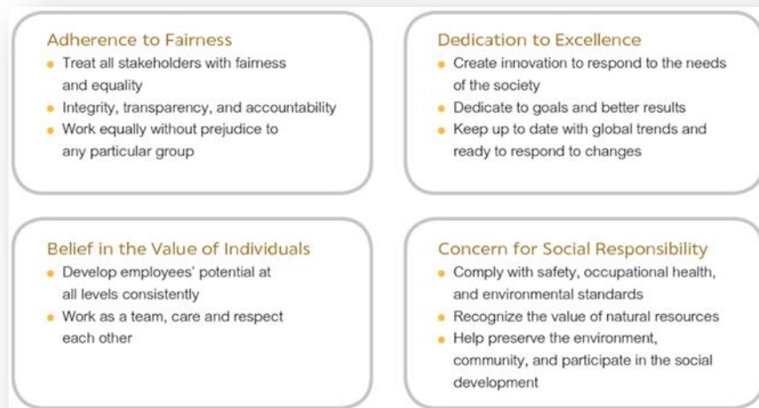
Figure 2: SCG's business philosophies (SCG, 2015)

Aside from the four core values mentioned, SCG also adapts to changes by adding two new working concepts – ‘ Open and Challenge ’. ‘Open’ stands for open-minded, willing to respect, listen, learn and collaborate while ‘Challenge’ means thinking out of the box and fearlessly asking or expressing opinions based on facts (SCG, 2016).