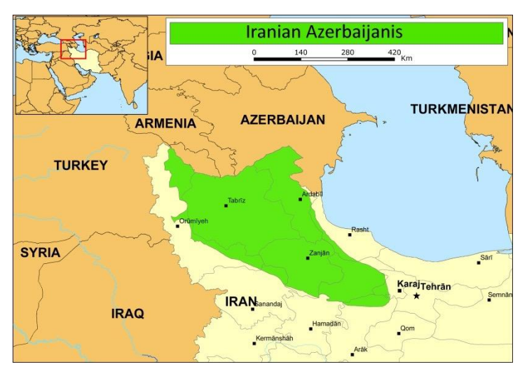
Figure 1. Iranian Azerbaijanis in northwest provinces of Iran.

In 2015, the population of the Republic of Azerbaijan was <u>estimated</u> at more than 9.5 million, 91.6% of which belonged to Azerbaijani ethnicity (Population census 2015). On the other side of the border with Iran, Iranian Azerbaijanis comprise the largest population of ethnic Azerbaijanis in the world. Being the dominant ethnicity in the Northwest of Iran, they live in three provinces of East and West Azerbaijan and Ardabil (Figure 1). They are the largest minority in Iran, comprising about 24% of the total population, with many living in other Iranian provinces. Many cities including Zanjan, Qazvin, and Hamadan have a large Azerbaijani population. Some Azerbaijanis have migrated to the Iranian capital Tehran, and other nearby cities such as Karaj, since long ago. In smaller numbers, they live in other Iranian provinces such as Kurdistan, Gilan, Markazi and Kermanshah (Shaffer, 2002: 221-225). There is still an intensive debate among Persian and Iranian Azerbaijani elites on how Iranian Azerbaijanis should be called. However, Persians and Azerbaijanis themselves commonly use the term " Turks " to refer to Iranian Azerbaijanis (pronounced as Tork in Persian). The term " Azeri " is not considered as correct by many academic scholars, but may be used by Iranians in formal conversations (Kasravi, 1946).