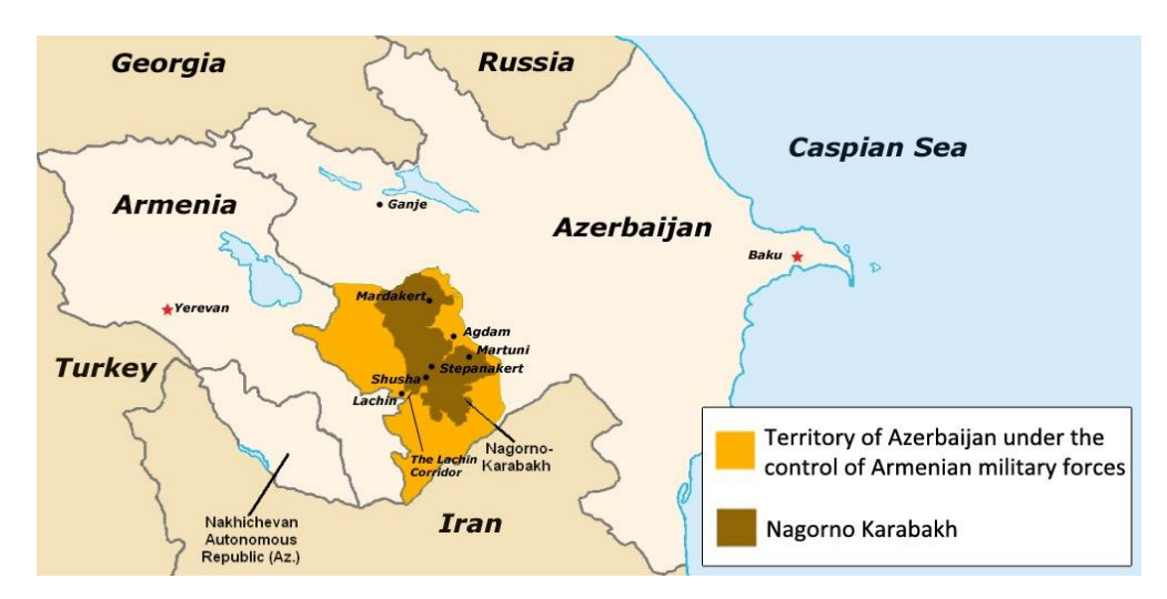
Figure 2. Nagorna Karabakh region: The conflicted area between the Republic of Azerbaijan and Armenia

Otherness for the Republic of Azerbaijan's citizens: A significant feature that distinguishes Iranian Azerbaijanis from those of the Republic of Azerbaijan is their paradoxical attitude towards Armenians. Following the Nagorno-Karabakh conflict between the Republic of Azerbaijan and Armenia, from the late 1980s to 1994 the citizens of the Republic of Azerbaijan assume Armenians as their sworn enemy, who committed atrocities in Karabakh city. However, Iranian Azerbaijanis never considered that war as their own, and have hosted a quite big Armenian diaspora living in peace for a long time in the city of Tabriz. Armenians live in one of the famous and rich neighborhoods of the city. Although their culture, religion, ethnicity and "blood" are far different from other citizens of Tabriz, they have been treated well in this city for a long time. Therefore, one of the major critics of Azerbaijani people in the Republic of Azerbaijan is questioning why Iranian people and government, especially their "brothers" in Iran who knew about the atrocities, keep good relations with Armenia and Armenians, their most hated enemy (Figure 2).