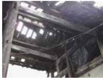
Fig.7. Few of Tiles Fell Down