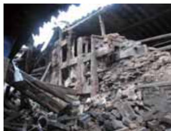
Fig.18. Various Materials in the Wall