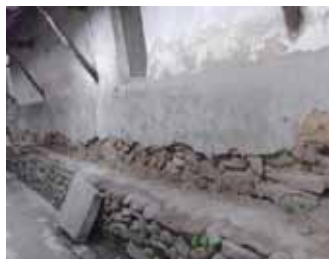
Fig.15. Materials on the Surface of Wall Foot Fell Down