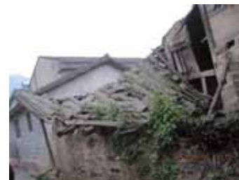
Fig.11 Structures Collapsed