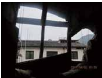
Fig.17. Collapsed Wall

Compared with the wall with only one material, some walls consist of complex materials, such as brick, gravel, mud or earth, collapsed easily. The heavy walls of through type timber frame is not the load-bearing structure, and also collapse easily with less flexible, particularly the mud wall (Fig.17, Fig.18 and Fig.19).