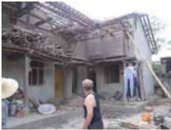
Fig.6. Most of Tiles Fell Down

Roofs damage during seismic action is a very common. Damage is depicted with the loosening of the tiles, the tiles move individually, not as a cohesive unit and fail, resulting in areas of the roofing tiles falling. All roofs experienced damage in varying degrees (Fig.6 and Fig.7). During construction the tiles were attached to the rafter without the use of fixture and bond. Thus, when the quake happened, the tiles easily fell down. The long semi-circular tiles that sit at the apex of the roof (Fig.6), upon construction, are not adhered with a bonding material. Subsequently upon seismic action of the tiles and structure below the tiles break away and fall.