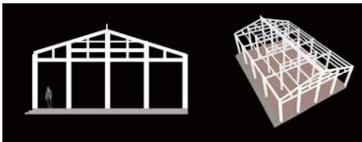
Fig.2 Wooden Structure of Gable Wall and Perspective in Through Type timber frame

The characteristics of through type timber frame (Fig.2 and Fig.3):