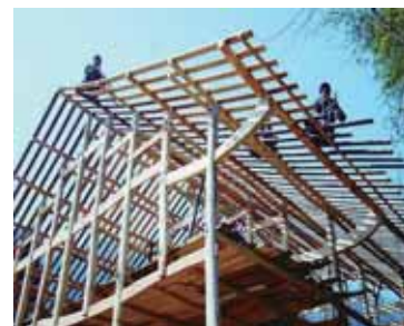
Fig.3 Building under Construction of Through type timber frame House