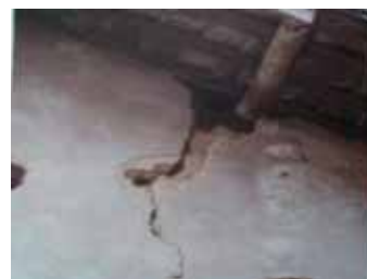
Fig.13. Cracks from the Connection of the Wall and Roof