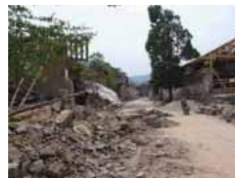
Fig.19. Collapsed Mud Wall