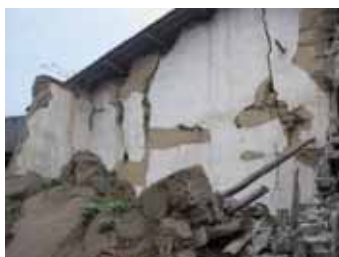
Fig.12. Few Cracks Occurred on the Wall

Purlines and beams were connected to the wall without fastening links. The dualities of the movement of the vertical and horizontal members during the quake have not worked in unison, causing failure. Materials act differently during seismic action; together they can work in uncomplimentary ways, causing failure, leading to cracks from these connections.