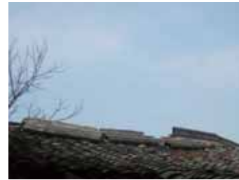
Fig.8. Ridge of the Roof Broken