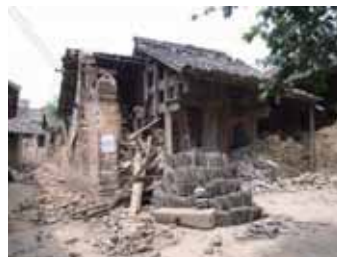
Fig.10 Some Structures Damaged