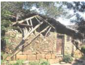
Fig.9 Few Structures Damaged

From observations taken of structural roof damage, we found a high percentage of rotten wood, reducing the structural integrity of the wooden supports. Rafters carry the loading of the roof tiles. Rafter members are generally light and thin. When there is damage to the wood it's not easy to restore and change with its high position, and limited access. In the quake, rotten wood easily fails and tiles fall down.