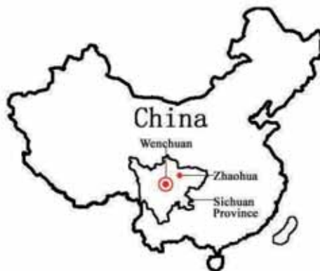
Fig.1 Position of Epicenter Wenchuan and Zhaohua Town

Zhaohua, a historic town, is located in the northeast of Sichuan province, approximately 220 kilometers northeast of epicenter, Wenchuan. The position of Zhaohua is shown in Fig.1. The detailed planning of repairing the Zhaohua historic district was finished under the guidance of National Historic City Research Center of Tongji University from April to October 2006. With this planning the authority of Zhaohua town had taken the corresponding measures for reparation of historic buildings.