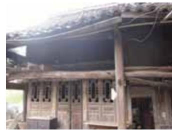
Fig.16. Wall Inclination

Compared with the wall with only one material, some walls consist of complex materials, such as brick, gravel, mud or earth, collapsed easily. The heavy walls of through type timber frame is not the load-bearing structure, and also collapse easily with less flexible, particularly the mud wall (Fig.17, Fig.18 and Fig.19).