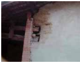
Fig.14. New Wall and Old One Shocked

During seismic action materials perform differently. Wood is able to absorb the energy, whilst brick and mud cannot. Due to this, the combination of materials worked differently in earthquake, resulting in structural failure (Fig.14).The surface materials on the foot of the wall had been loosened due to precipitation. The already weakened material failed during the earthquake, the surface materials fell away easily (Fig.15). The through type timber frame structurally performed well in the quake due to its lateral stiffness, partial failure occurred resulting in the leaning of gable to one side (Fig.16).