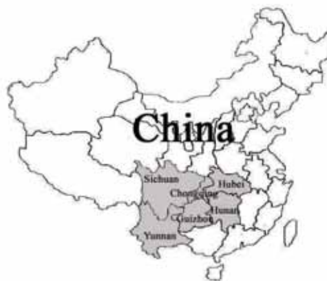
Fig.4 Distribution of type timber frame house

The wooden structure is also a load-bearing system, columns and horizontal beams are the main load-bearing elements, as are the retaining wall structure, which are flat and flexible to meet different seismic loading requirement. Commonly, substructure, such as walls are composed of mud, adobe, pebble wood, walls, bamboo, which are easy to be found nearby.